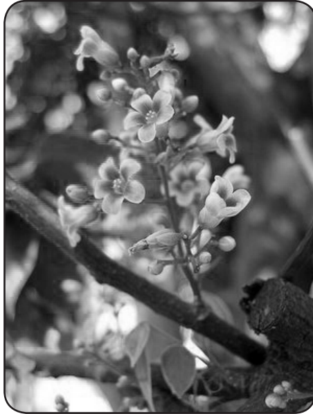
Spiritual significance of the flower: Organized teamwork

In future, do we see a similar possibility of succession planning in business organizations too?