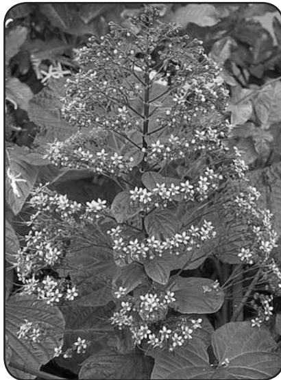
Spiritual significance of the flower: Grouping

The tasks of a leader are to lead his subordinates towards the successful accomplishment of the organizational goals, motivate them to work better by improving their morale, imposing discipline whenever and wherever required in the organization and ensuring the establishment of a perfect harmony among them. While imposing discipline, a leader should keep in mind that whatever needs to be done should be done in the right spirit. The subordinates should also realize that they are being guided by a leader who may be strict but at the same time is upright, insightful and sympathetic towards them. In his letters, Sri Aurobindo has written that efficiency and discipline—though they are indispensable for work—are dependent on the "personality of the superior, his influence on the subordinates, his firmness, tact,' and 'kindness in dealing with them." (SABCL, volume 23, p. 710)